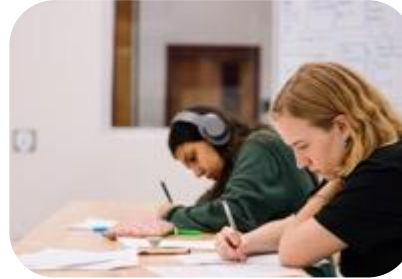
Legal terms and conditions – payment and liability