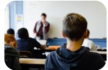
Legal entity and growth limits