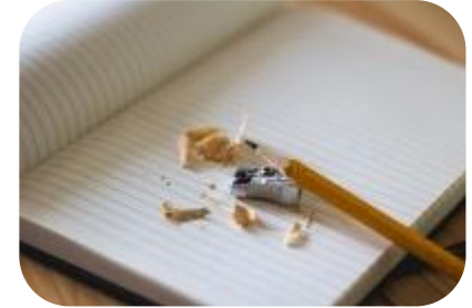
Can they or will they pay?