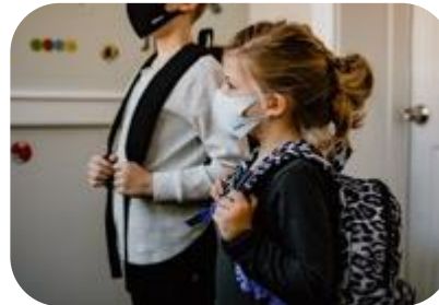
Associates and liability limits