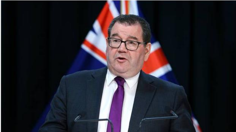
Finance Minister Grant Robertson.