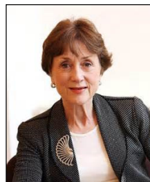
Dame Carol Black Principal of Newnham College, Cambridge